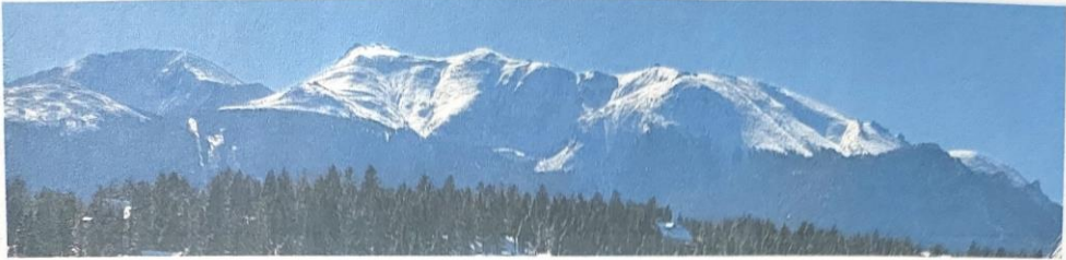
Pikes Peak, Nov. '23